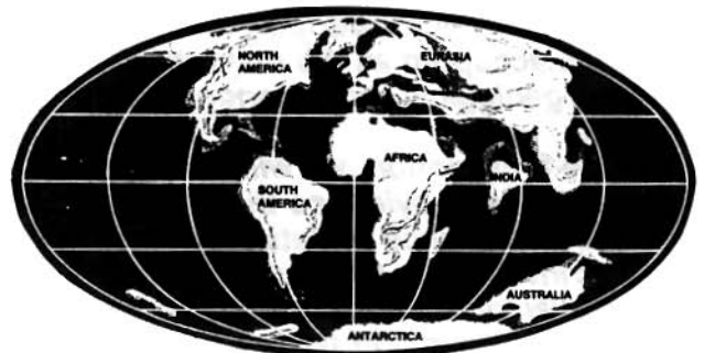
45 MILLION YEARS AGO