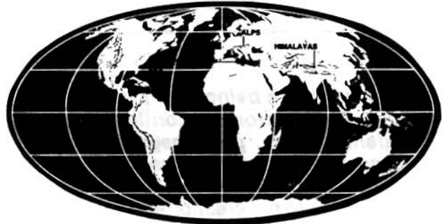
100 MILLION YEARS AGO