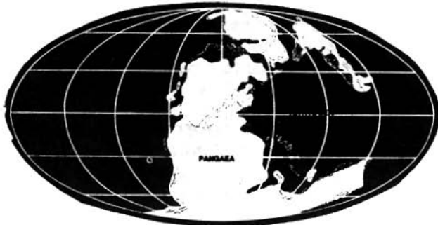
250 MILLION YEARS AGO